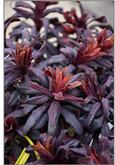
Ruby Glow Wood Spurge flowers

This is a relatively low maintenance plant, and should only be pruned after flowering to avoid removing any of the current season's flowers. Deer don't particularly care for this plant and will usually leave it alone in favor of tastier treats. It has no significant negative characteristics.