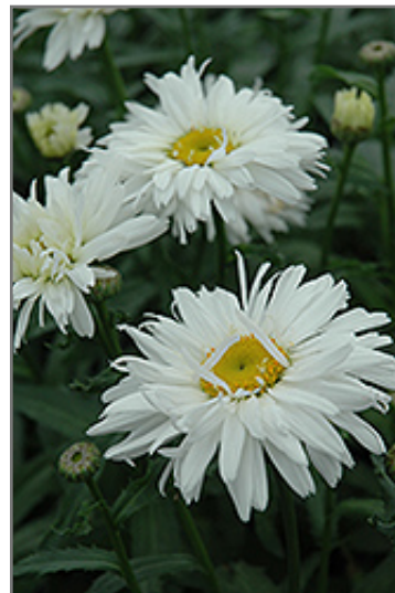
Razzle Dazzle Shasta Daisy flowers