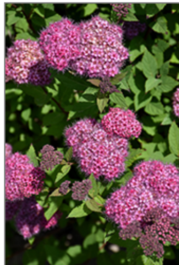
Double Play Artisan Spirea flowers

This shrub will require occasional maintenance and upkeep, and is best pruned in late winter once the threat of extreme cold has passed. It is a good choice for attracting butterflies to your yard, but is not particularly attractive to deer who tend to leave it alone in favor of tastier treats. It has no significant negative characteristics.