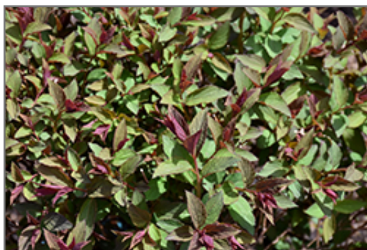
Double Play Artisan Spirea foliage