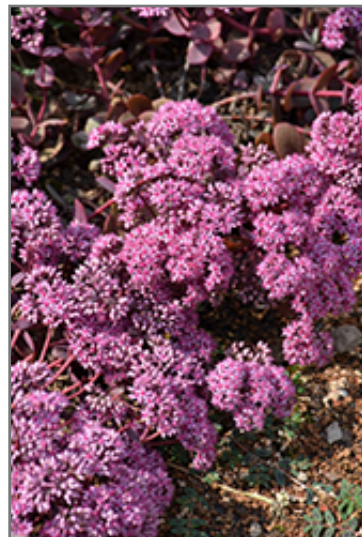
Cherry Tart Stonecrop flowers

Cherry Tart Stonecrop is a fine choice for the garden, but it is also a good selection for planting in outdoor pots and containers. It is often used as a 'filler' in the 'spiller-thriller-filler' container combination, providing a mass of flowers and foliage against which the larger thriller plants stand out. Note that when growing plants in outdoor containers and baskets, they may require more frequent waterings than they would in the yard or garden.