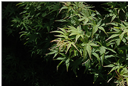
Akita Yatsubusa Japanese Maple foliage

Akita Yatsubusa Japanese Maple is recommended for the following landscape applications;