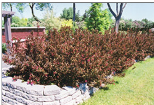
Wine and Roses Weigela