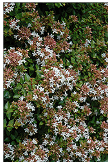
Rose Creek Abelia flowers