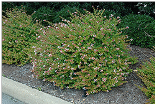
Rose Creek Abelia in bloom

This shrub will require occasional maintenance and upkeep, and should only be pruned after flowering to avoid removing any of the current season's flowers. It is a good choice for attracting birds, bees and butterflies to your yard, but is not particularly attractive to deer who tend to leave it alone in favor of tastier treats. It has no significant negative characteristics.