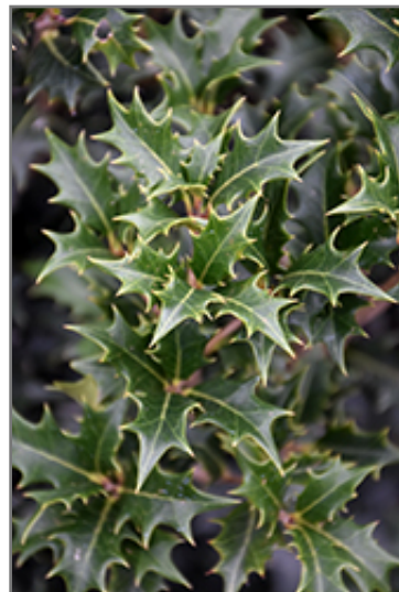
Gulftide False Holly foliage