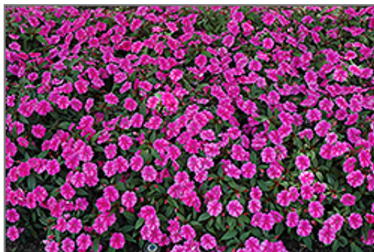
Bounce Pink Flame Impatiens in bloom