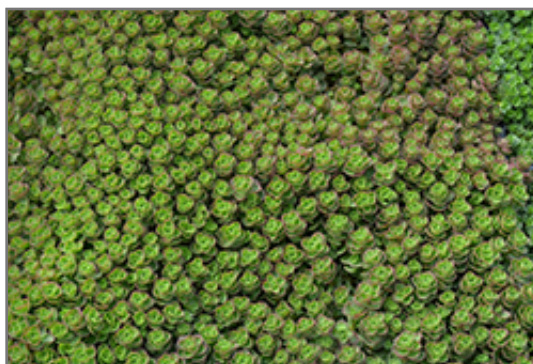
Dragon's Blood Stonecrop foliage