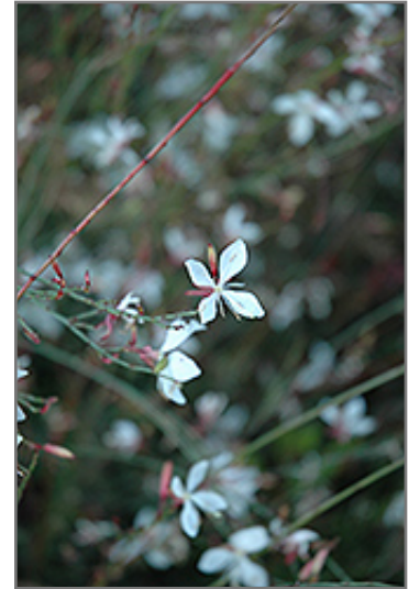
Karalee White Gaura flowers

Karalee White Gaura is recommended for the following landscape applications;