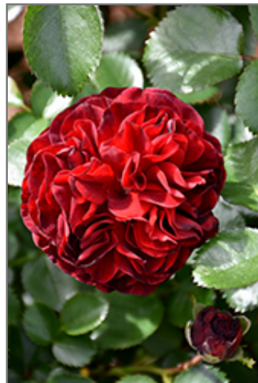
Canyon Road Rose flowers