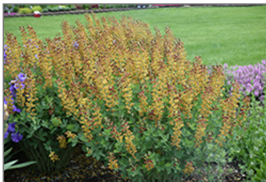
Decadence Cherries Jubilee False Indigo in bloom