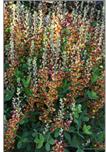
Decadence Cherries Jubilee False Indigo flowers

Decadence Cherries Jubilee False Indigo is a fine choice for the garden, but it is also a good selection for planting in outdoor pots and containers. With its upright habit of growth, it is best suited for use as a 'thriller' in the 'spiller-thriller-filler' container combination; plant it near the center of the pot, surrounded by smaller plants and those that spill over the edges. It is even sizeable enough that it can be grown alone in a suitable container. Note that when growing plants in outdoor containers and baskets, they may require more frequent waterings than they would in the yard or garden.