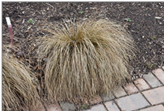
Prairie Fire Sedge

Prairie Fire Sedge is recommended for the following landscape applications;