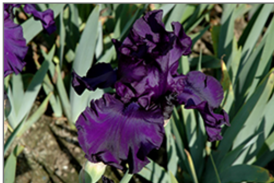
Dusky Challenger Iris flowers