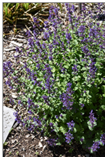
Aroma Violet Catmint flowers