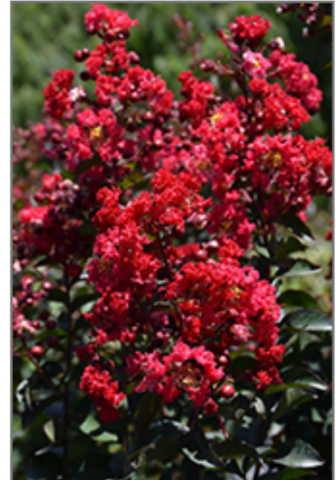
Princess Zoey Crape Myrtle flowers