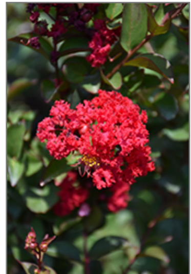
Princess Zoey Crape Myrtle flowers