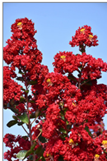
Double Dynamite Crapemyrtle flowers