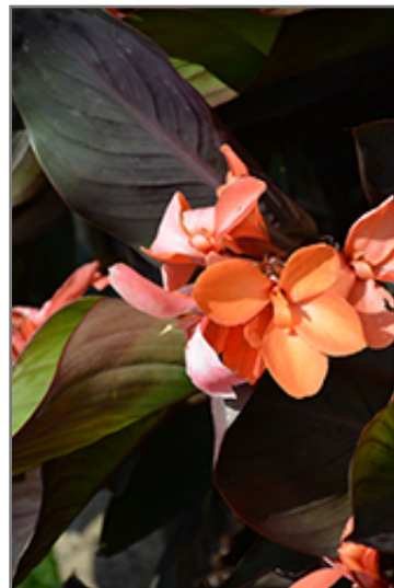
CannaSol Happy Wilma Canna flowers

This plant is native to the tropics and prefers growing in moist environments with evenly warm conditions all year round. In our climate, it is usually grown as an outdoor annual in the garden or in a container. If you want it to survive the winter, it can be brought in to the house and provided with special care, and then returned to the garden the following season. In its preferred tropical habitat, it can grow to be around 18 inches tall at maturity, with a spread of 14 inches. However, when grown as an annual or when overwintered indoors, it can be expected to perform differently, and its exact height and spread will depend on many factors; you may wish to consult with our experts as to how it might perform in your specific application and growing conditions.