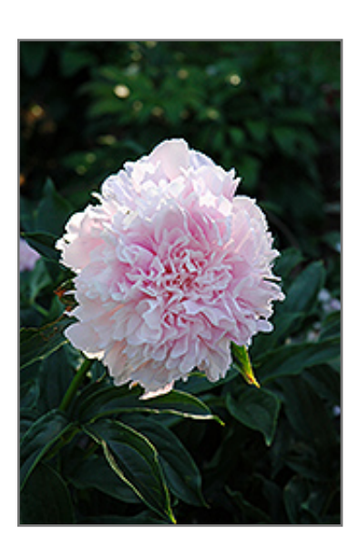
Dinner Plate Peony flowers

Dinner Plate Peony will grow to be about 30 inches tall at maturity, with a spread of 3 feet. When grown in masses or used as a bedding plant, individual plants should be spaced approximately 30 inches apart. The flower stalks can be weak and so it may require staking in exposed sites or excessively rich soils. It grows at a slow rate, and under ideal conditions can be expected to live for approximately 20 years. As an herbaceous perennial, this plant will usually die back to the crown each winter, and will regrow from the base each spring. Be careful not to disturb the crown in late winter when it may not be readily seen!