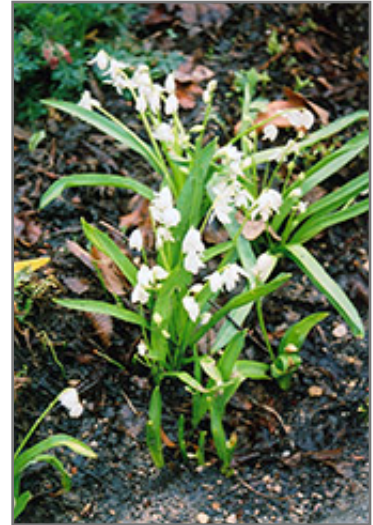
White Spring Squills in bloom

White Spring Squills will grow to be only 4 inches tall at maturity extending to 6 inches tall with the flowers, with a spread of 4 inches. It grows at a fast rate, and under ideal conditions can be expected to live for approximately 5 years. As an herbaceous perennial, this plant will usually die back to the crown each winter, and will regrow from the base each spring. Be careful not to disturb the crown in late winter when it may not be readily seen! As this plant tends to go dormant in summer, it is best interplanted with late-season bloomers to hide the dying foliage.