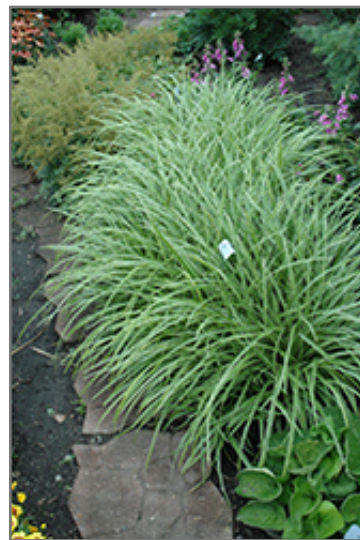
Ice Dance Sedge