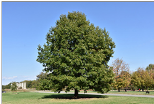
Scarlet Oak