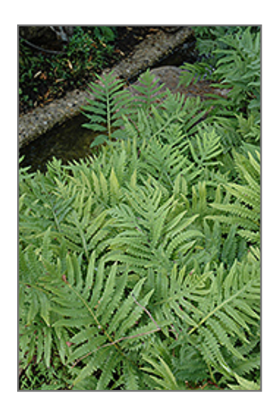
Sensitive Fern foliage

This is a high maintenance plant that will require regular care and upkeep, and is best cleaned up in early spring before it resumes active growth for the season. Gardeners should be aware of the following characteristic(s) that may warrant special consideration;