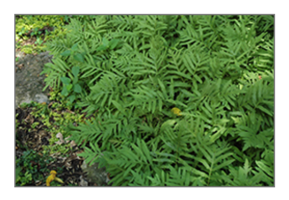
Sensitive Fern