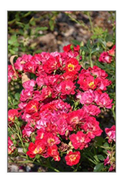
Pink Drift Rose flowers