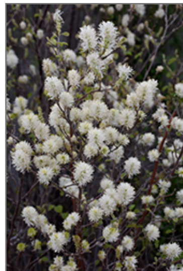
Large Fothergilla flowers