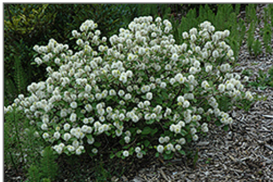
Large Fothergilla in bloom