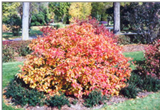
Large Fothergilla in fall

This shrub does best in full sun to partial shade. It requires an evenly moist well-drained soil for optimal growth, but will die in standing water. It is not particular as to soil type, but has a definite preference for acidic soils, and is subject to chlorosis (yellowing) of the foliage in alkaline soils. It is somewhat tolerant of urban pollution. This species is native to parts of North America.