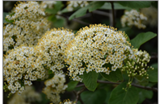
Lantanaphyllum Viburnum flowers

This is a relatively low maintenance shrub, and should only be pruned after flowering to avoid removing any of the current season's flowers. It is a good choice for attracting birds to your yard, but is not particularly attractive to deer who tend to leave it alone in favor of tastier treats. It has no significant negative characteristics.