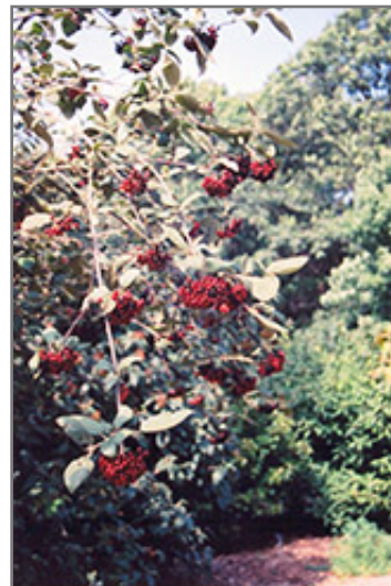
Lantanaphyllum Viburnum fruit

This shrub does best in full sun to partial shade. It prefers to grow in average to moist conditions, and shouldn't be allowed to dry out. It is not particular as to soil type or pH. It is highly tolerant of urban pollution and will even thrive in inner city environments. This particular variety is an interspecific hybrid.