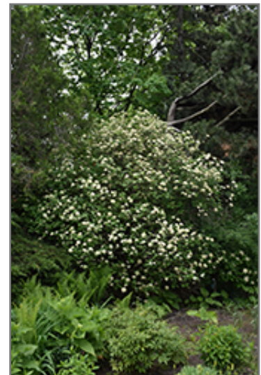
Lantanaphyllum Viburnum in bloom