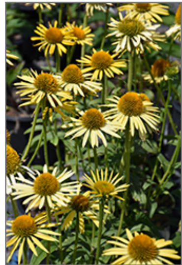
Maui Sunshine Coneflower flowers