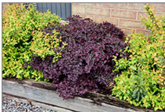
Purple Pixie Fringeflower