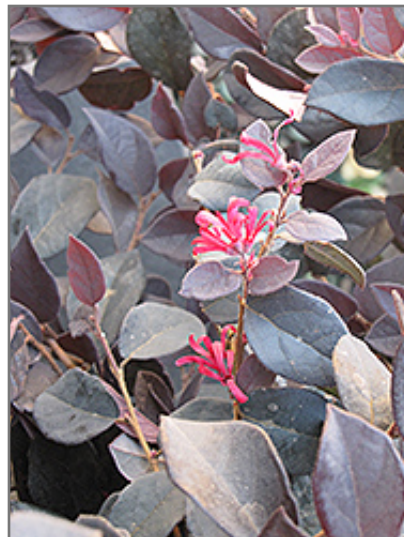
Purple Pixie Fringeflower flowers

Purple Pixie Fringeflower is recommended for the following landscape applications;