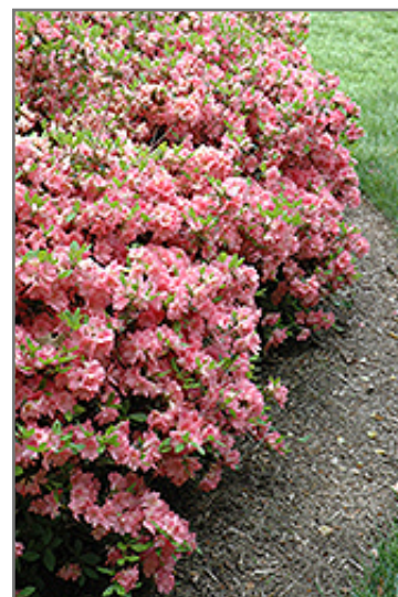
Blaauw's Pink Azalea in bloom