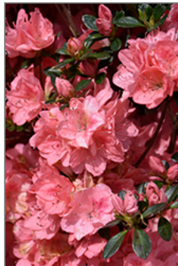
Blaauw's Pink Azalea flowers