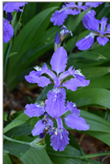
Rooftop Iris flowers