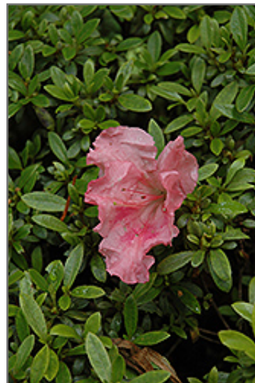
Gumpo Pink Azalea flowers