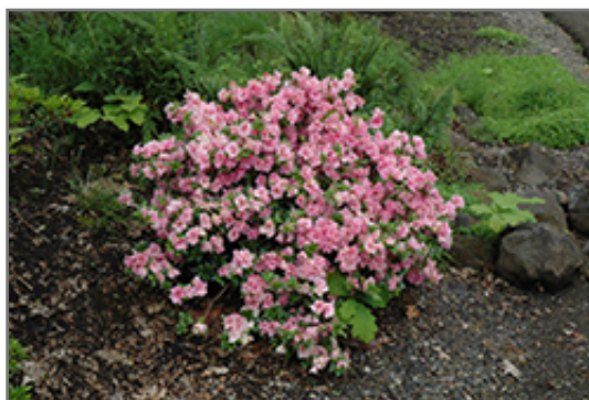
Gumpo Pink Azalea in bloom