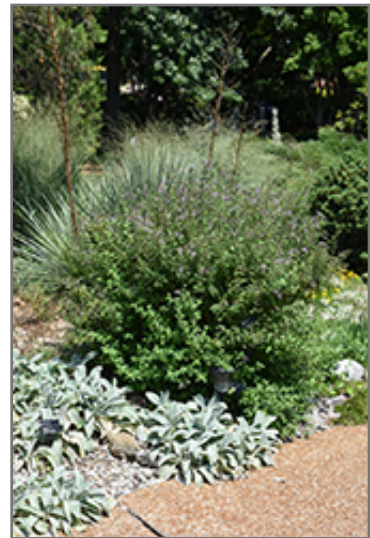
Leptodermis in bloom