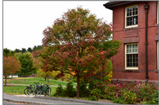
Gingerbread Paperbark Maple in fall