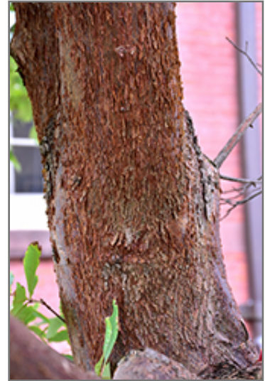
Gingerbread Paperbark Maple bark

* This is a 'special order' plant - contact store for details