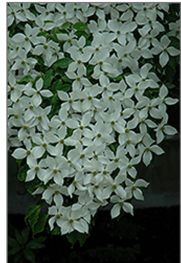
Lustgarten's Weeping Chinese Dogwood flowers