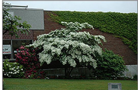
Lustgarten's Weeping Chinese Dogwood in bloom

Lustgarten's Weeping Chinese Dogwood is a multi-stemmed deciduous tree with a shapely form and gracefully arching branches. Its average texture blends into the landscape, but can be balanced by one or two finer or coarser trees or shrubs for an effective composition.