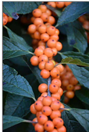
Winter Gold Winterberry fruit