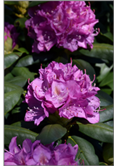
Roseum Elegans Rhododendron flowers