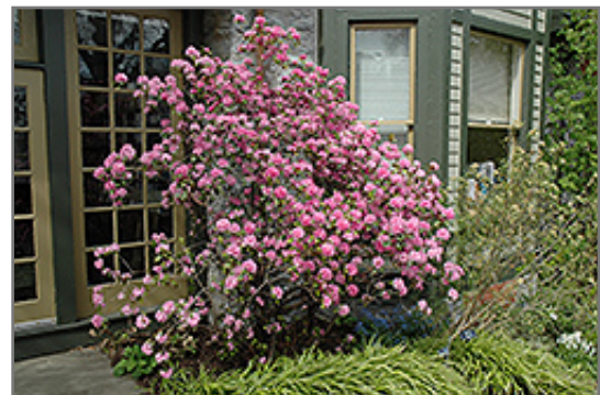
Olga Mezitt Rhododendron in bloom