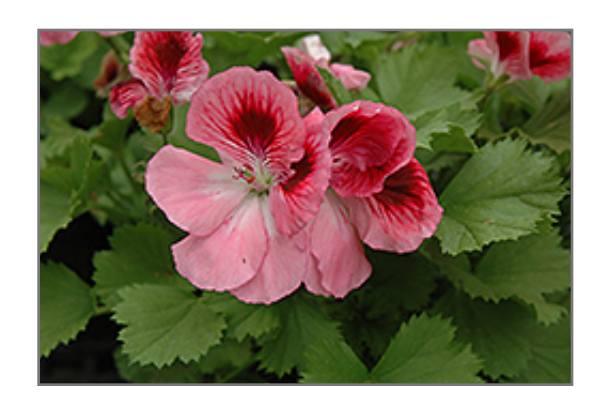
Elegance Rose Bicolor Geranium flowers