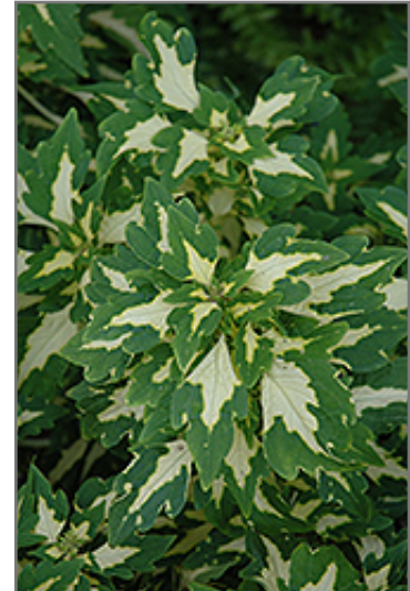
ColorBlaze Alligator Tears Coleus foliage