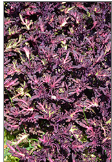
Merlin's Magic Coleus foliage