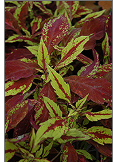
Pineapple Coleus foliage