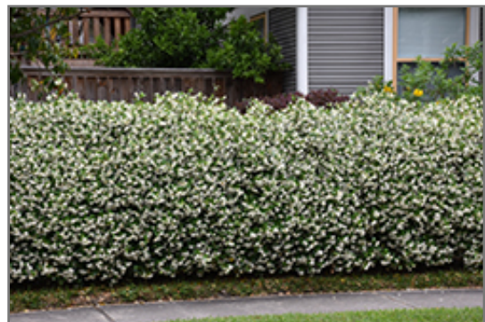
Confederate Star-Jasmine in bloom