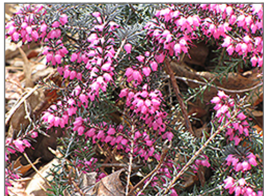
Spring Heath flowers