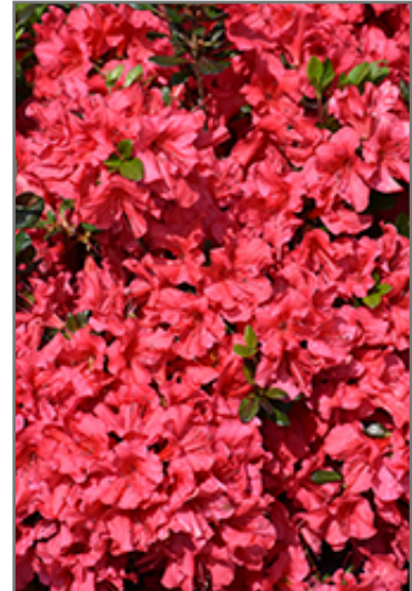
Johanna Azalea flowers