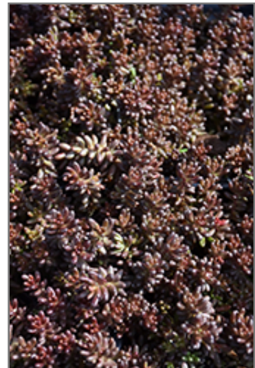
Murale Stonecrop foliage