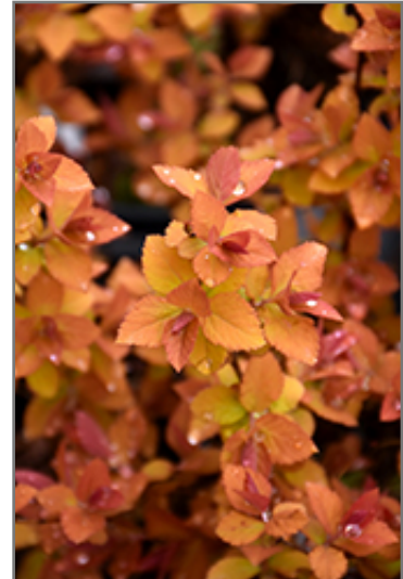
Double Play Big Bang Spirea foliage

This shrub should only be grown in full sunlight. It prefers to grow in average to moist conditions, and shouldn't be allowed to dry out. It is not particular as to soil type or pH. It is highly tolerant of urban pollution and will even thrive in inner city environments. This particular variety is an interspecific hybrid.