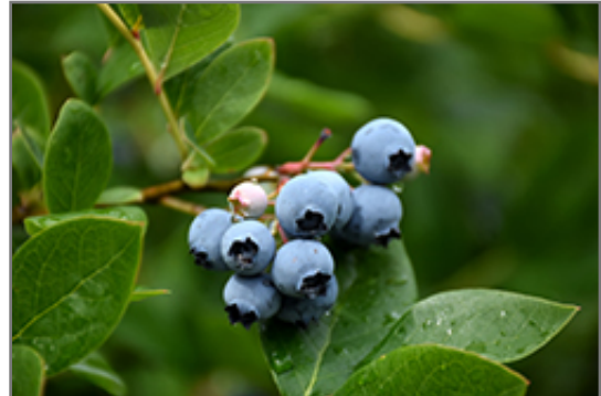
Northcountry Blueberry fruit

Northcountry Blueberry features dainty clusters of white bell-shaped flowers with shell pink overtones hanging below the branches in mid spring. It has green deciduous foliage. The glossy oval leaves turn an outstanding scarlet in the fall. It features an abundance of magnificent blue berries in mid summer.