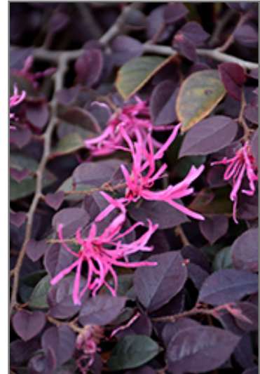
Crimson Fire Chinese Fringeflower flowers

Crimson Fire Chinese Fringeflower is recommended for the following landscape applications;