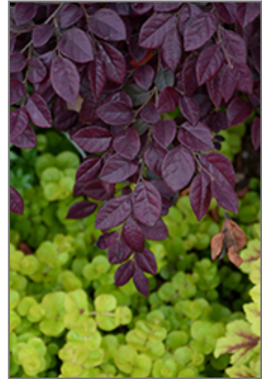
Crimson Fire Chinese Fringeflower foliage

This shrub does best in full sun to partial shade. It prefers to grow in average to moist conditions, and shouldn't be allowed to dry out. It is particular about its soil conditions, with a strong preference for rich, acidic soils. It is somewhat tolerant of urban pollution. Consider applying a thick mulch around the root zone in winter to protect it in exposed locations or colder microclimates. This is a selected variety of a species not originally from North America.