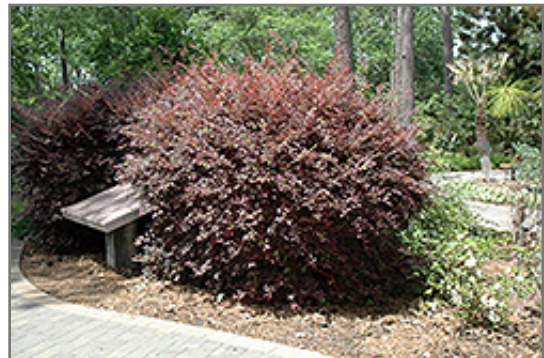
Daruma Chinese Fringeflower